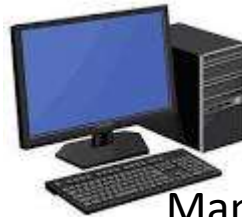
Manufacture's Web site