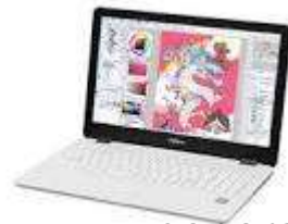
general review site