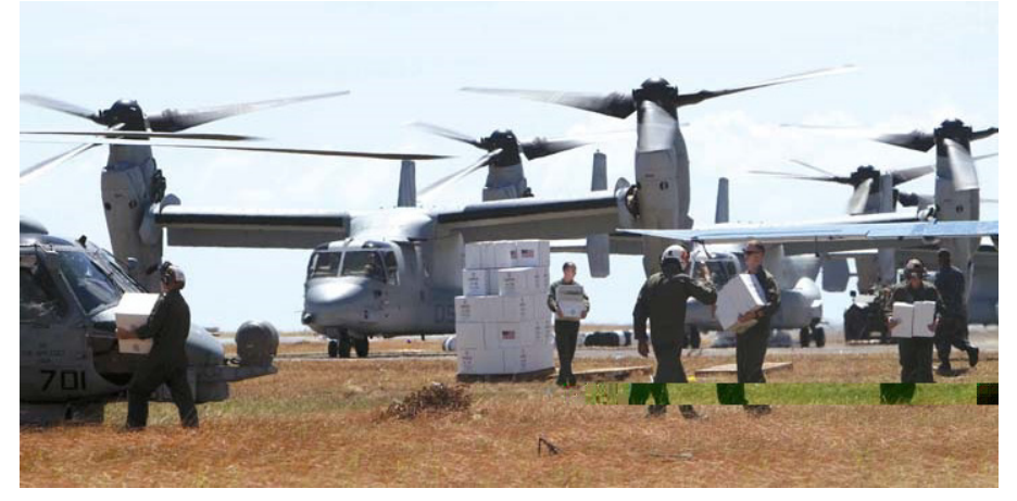
Relief goods continue to arrive for Yolanda victims.

Meanwhile, donations from United Airlines employees and customers have topped more than $850,000 for AmeriCares, American Red Cross and Operation USA to aid in