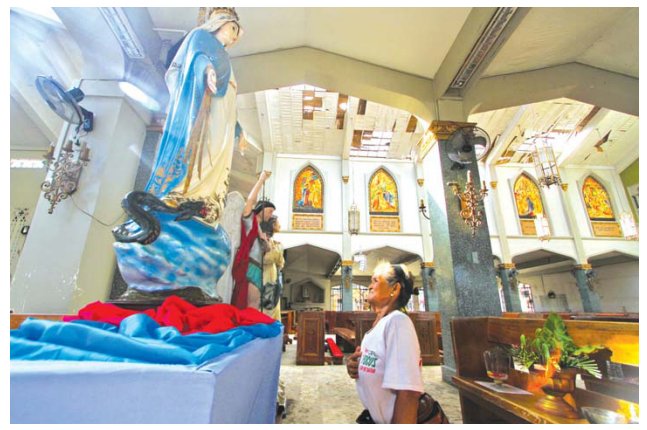
agents and pay attention to government travel Keeping the faith: An old lady says a silent prayer for her beloved city.