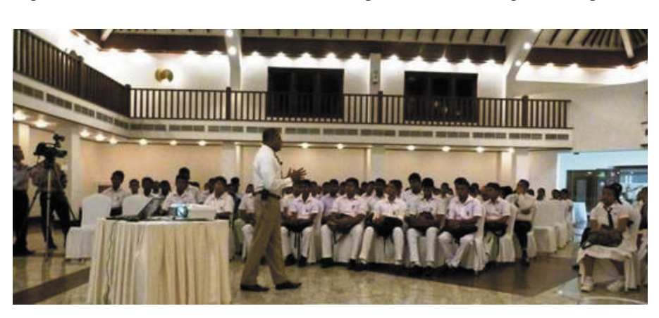
Students from 13 difference schools at the event

Source: Ceylon Chamber of Commerce Media Release, February 7, 2014