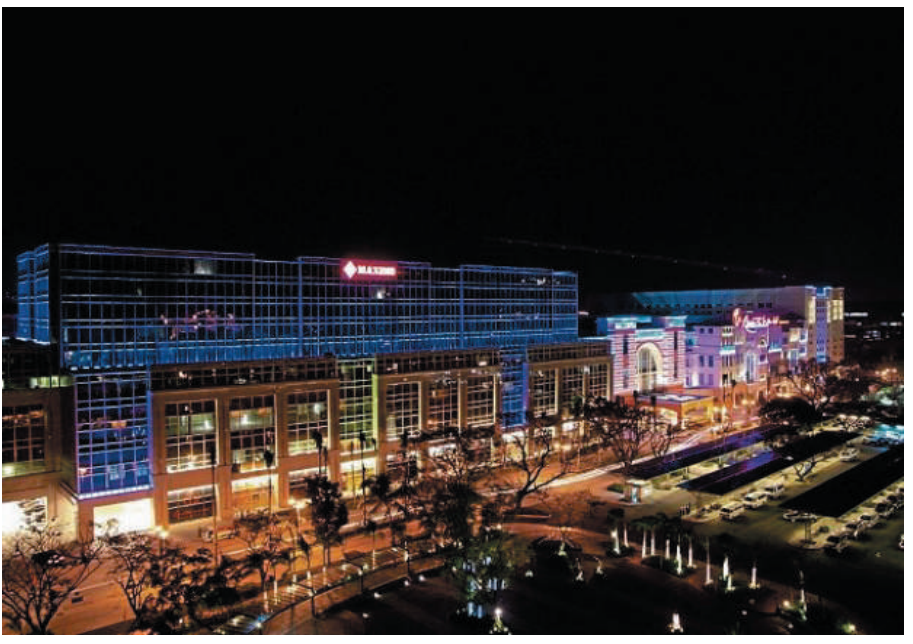
Accommodate the growing number of visitors, more hotels are slated to be constructed within Newport City by 2016. Metro Manila's stock of hotel rooms will expand by 22.9 percent year-on-year to end this year at 21,532 as more property developers invest in tourism, widely deemed as the low-hanging fruit for the domestic economy, property consulting firm Colliers International said.

For the first half of this year, Colliers said only 20 percent of additional hotel rooms in the 2014 pipeline had been actually delivered, brought largely by four projects, namely Tune Hotels Ortigas (182), Azumi Boutique Hotel (187), Marco Polo Ortigas (313) and Citadines